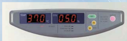
CO 2 Incubator